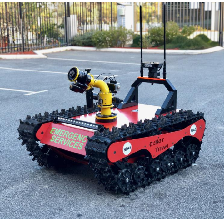
Rio Tinto Pioneering pitch 2019 Fire robot